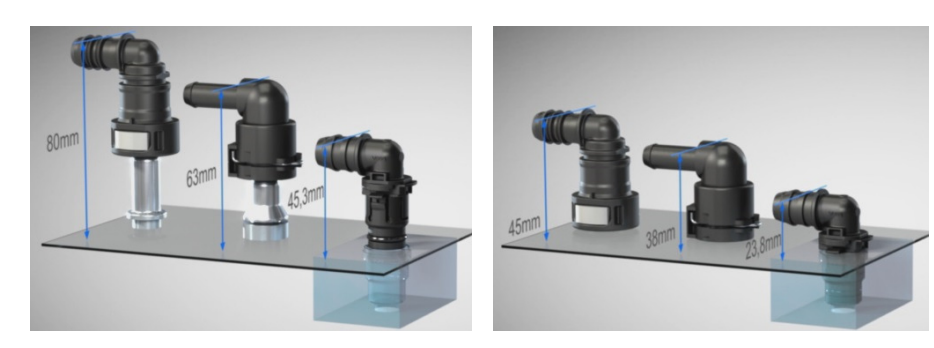
Comparison: SAE 11,8 VDA NW8 VOSS 271 S10

VOSS Automotive GmbH · P. O. Box 15 40 · 51679 Wipperfürth · Leiersmühle 2-6 · 51688 Wipperfürth · Germany Phone: +49 2267 63-0 · Fax: +49 2267 63-5982 · automotive@voss.net · www.voss.net